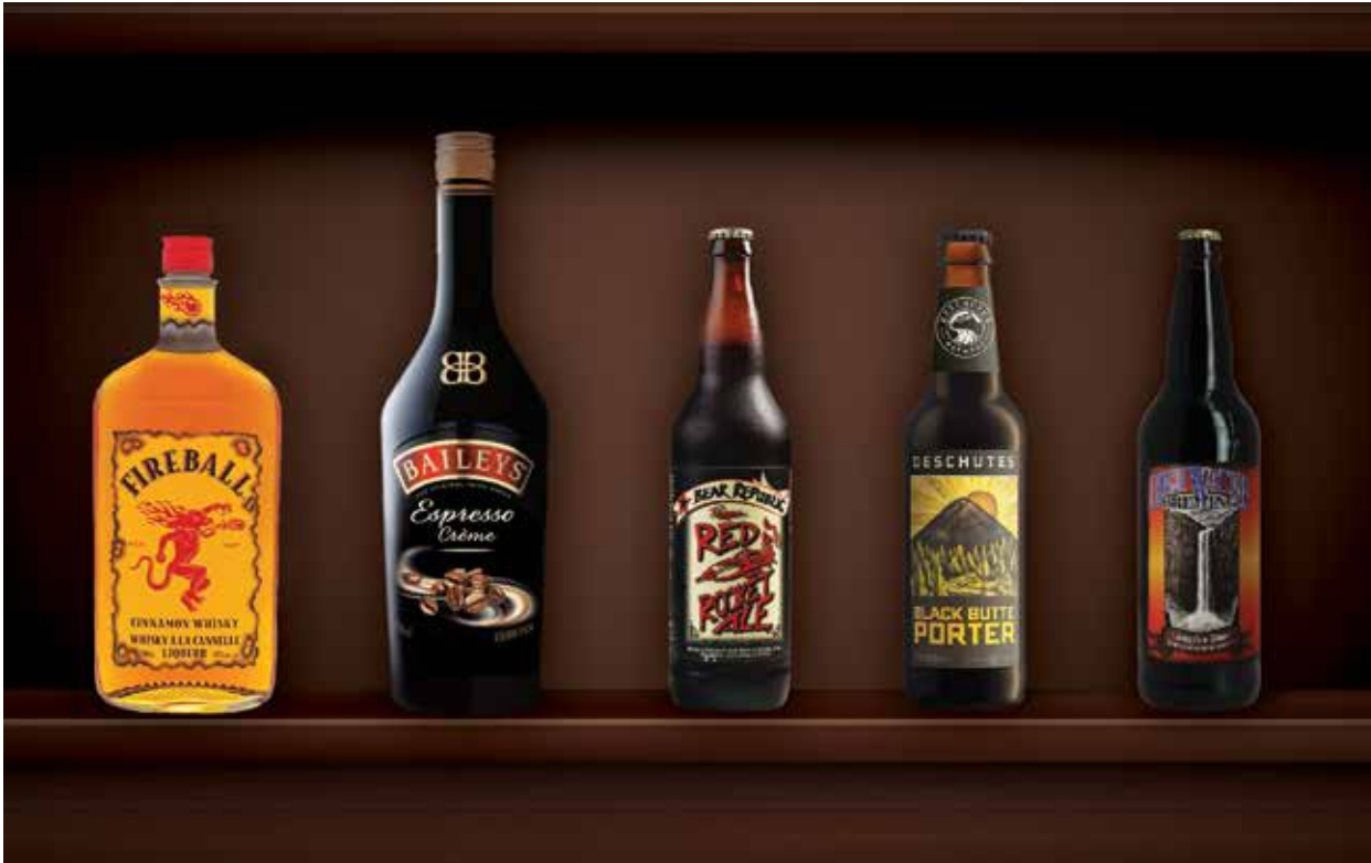
Figure 3 Examples of Alcoholic Beverages Included in the Holiday Raffle Prizes