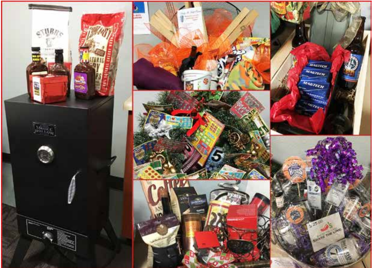
Figure 2 Baskets Sold at Corrections' Holiday Raffle