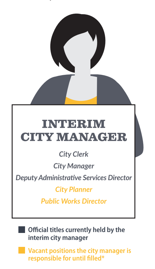
Figure 3 Blythe's Interim City Manager Holds Numerous Positions and Responsibilities

Source: City personnel records, organization charts, staff directory, city municipal code, and interviews with city management.