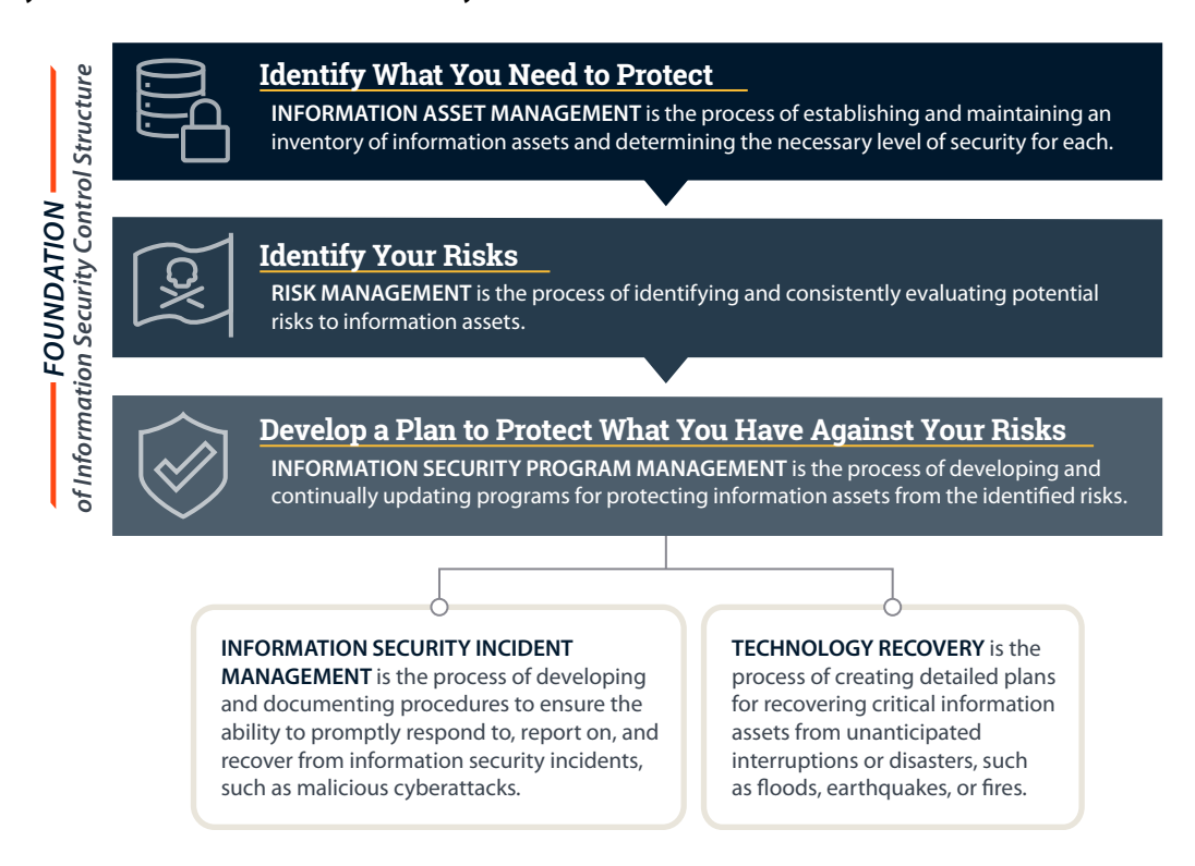
Figure 2 Five Key Control Areas of Information Security Standards