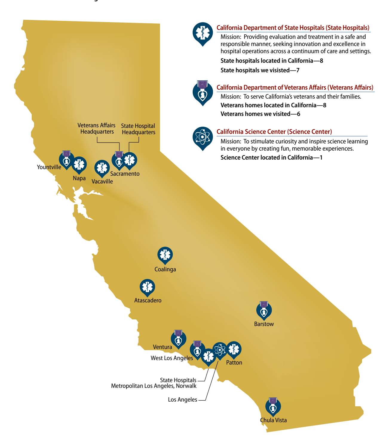
Figure 1 Locations We Visited During This Review

Sources: California State Auditor's visits to the locations listed above and Web sites for the State Hospitals, Veterans Affairs, and the Science Center.