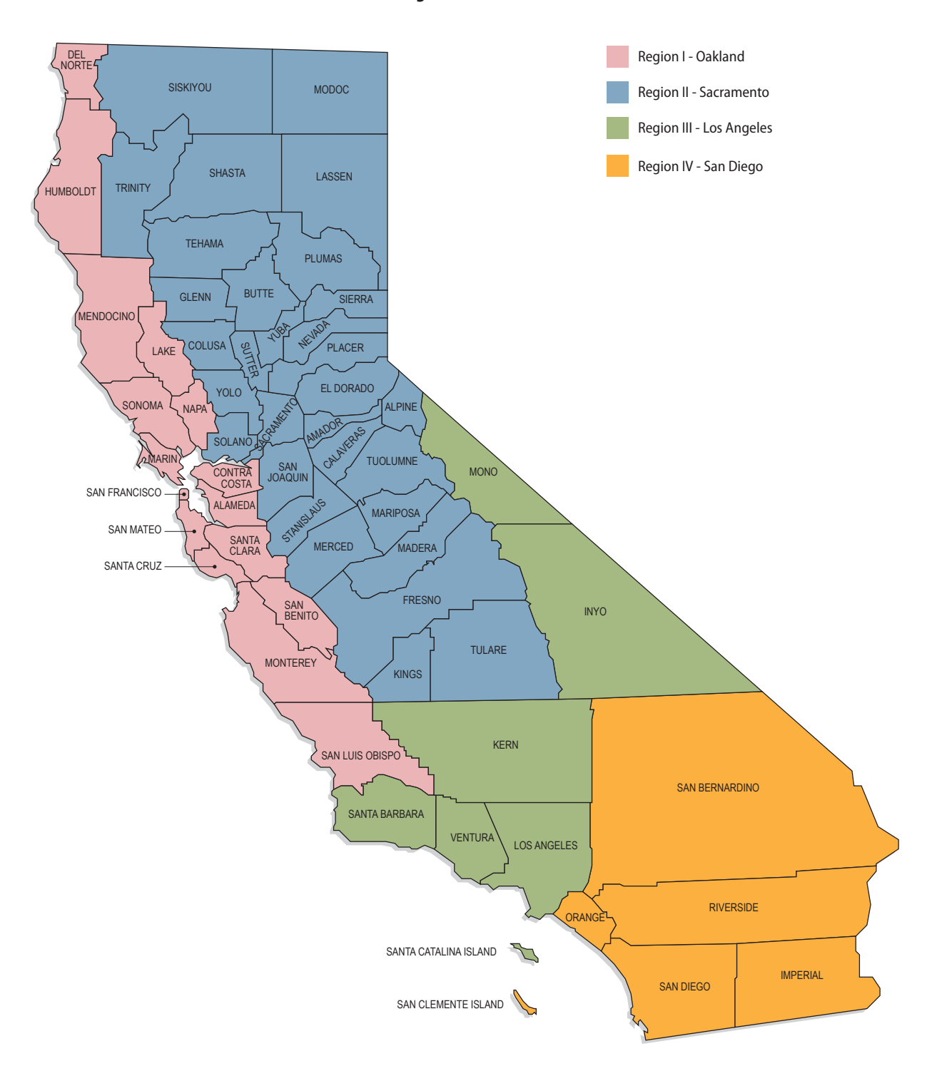
Figure 1 Territories of the Division of the State Architect's Regional Offices